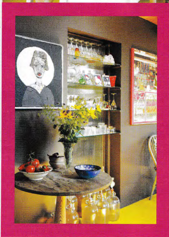
ABOVE Vintage glasses on glass shelves are displayed in front of a polycarbonate window to the bedroom. They often shake and tinkle when trains rumble by. Elderflower wine ferments in demijohns on the floor. The paintings are by John Kiki (left) and Trevor Burgess (right).

Trevor made the wall of shelving for books and LPs. The 1940s table and chairs were second-hand finds, sanded back to the bare oak, and the chairs recovered in African cloth from a London market. The side chairs are vintage finds that have been reupholstered.