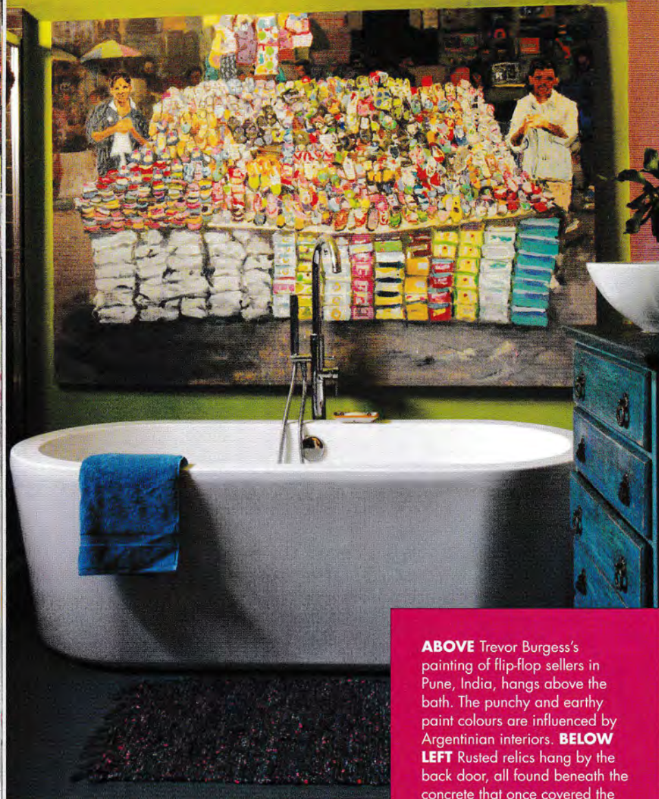
ABOVE Trevor Burgess's painting of flip-flop sellers in Pune, India, hangs above the bath. The punchy and earthy paint colours are influenced by Argentinian interiors. BELOW LEFT Rusted relics hang by the back door, all found beneath the concrete that once covered the back garden. BELOW RIGHT Wild and more cultivated flowers frame the entrance to Trevor and Andrea's home. The blue paint hints at the bright interiors within.