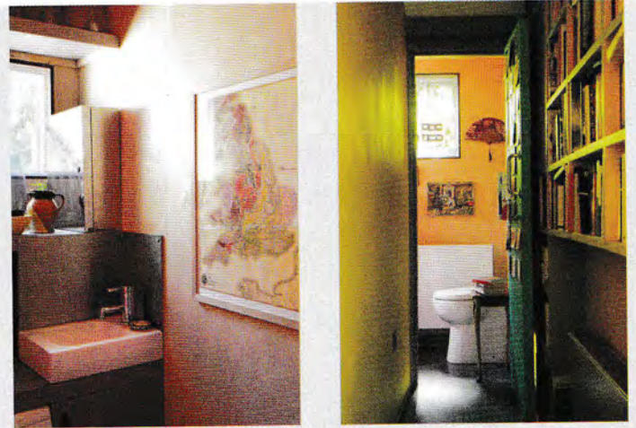
ABOVE Walls in the WC are clad in untreated plywood. The map is a vintage find; acidic colours brighten the corridor, looking towards the WC. The door handle dates from the building's days as a builders' yard. The side table is a charity-shop buy. BELOW Old family photographs are tacked to the ply wall in the bedroom. The vintage suitcase was found in a charity shop.